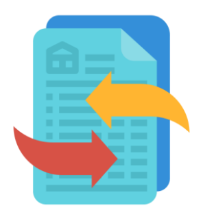
5 Lac + Invoices Discounted

MCRED is an invoice discounting platform which allows anchors to enable quick access of funds to its suppliers