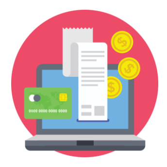
Rs. 10,000 Cr + Invoice Discounted